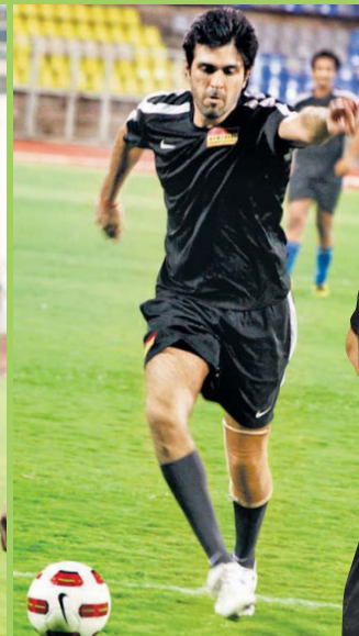
ACTION TIME: Harman Baweja