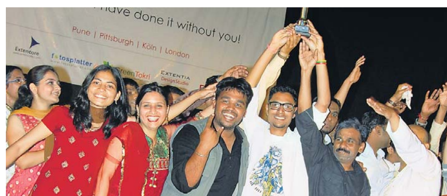
Extentians cheer while receiving the awards