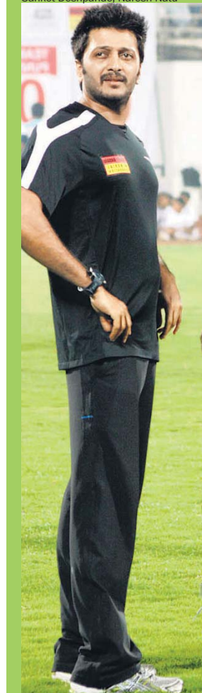
PASS IT ON: Ritesh Deshmukh