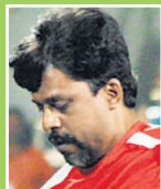
BRING IT ON: Upendra Limaye and (right) Sohail Khan