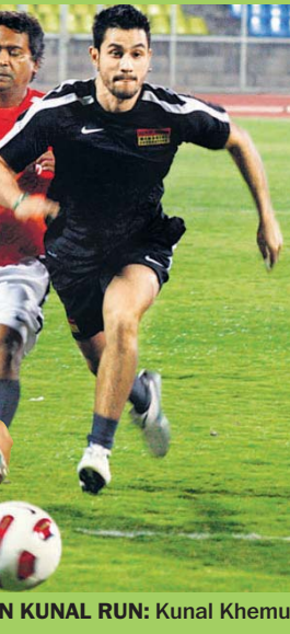
RUN KUNAL RUN: Kunal Khemu PLAY-BOY: Shabbir Ahluwalia